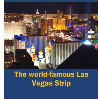
The world-famous Las Vegas Strip

Day 13: Today, after enjoying a Continental Breakfast, you depart for home... a perfect time to chat with your friends about all the fun things you've done, the great sights you've seen and where your next group trip will take you!