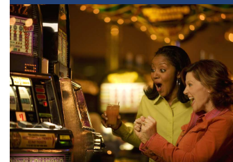
World-class Gaming and Excitement