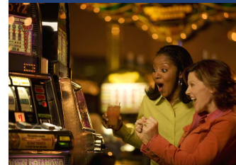
Give Lady Luck a Spin!