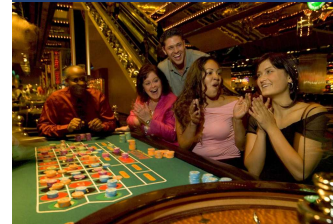
World-class gaming in Atlantic City awaits!

Day 3: Today after enjoying a Hot Breakfast, you depart for home... A perfect time to chat with your friends about all the fun things you've done, the great sights you've seen and where your next group trip will take you!