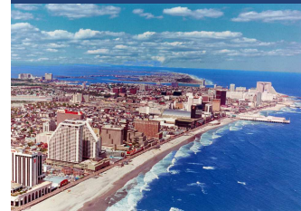
The spectacular Atlantic Ocean Shore.